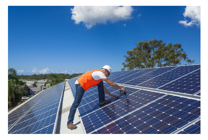
LET THE SUNSHINE IN!