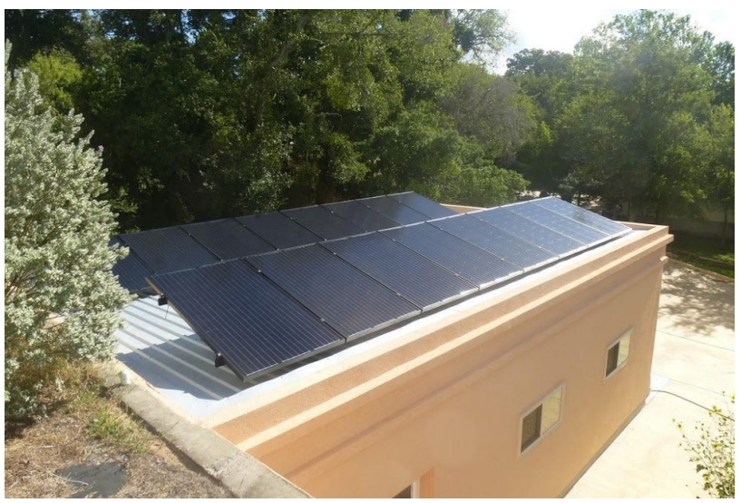
Tilted, Flat-Roof Mounted SED (Bastrop, Texas)