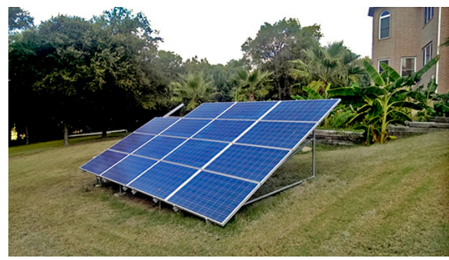
Ground-Mounted SED (Little Elm, Texas)