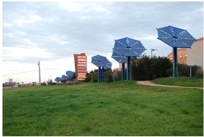
Ground Mounted Solar Panels as Art (Austin, Texas)

Height regulations can help alleviate local land use concerns over aesthetics (e.g. how much of the system can be seen from the street). However, height restrictions can prevent an SED from being installed if the building on which it is sited is already at maximum allowed height, if the municipality does not specify an exemption for the system in its ordinance. It is also important to keep in mind that it is beneficial to allow an air space between solar PV panels and the building or structure that they are mounted on because the cooler the module, the more electricity it produces. Separate height language options are provided for sloped and flat roofs. In communities with both sloped and flat roof types, it may be most appropriate to include separate regulations by roof type.