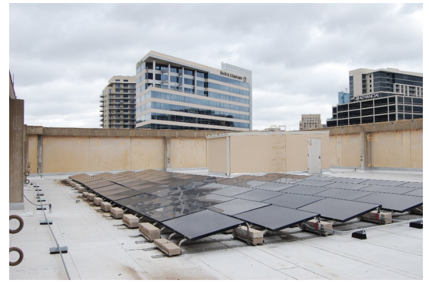
Roof of Oncor Electric building (Dallas, Texas)