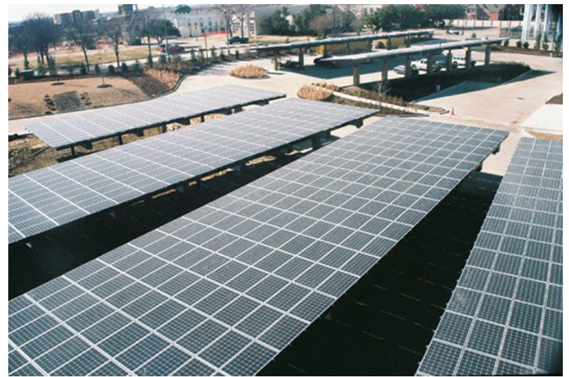
Solar Parking Canopies, Irving West Library (Irving, Texas)

limits (especially in commercial settings), and should also require a minimum height clearance to allow access by emergency service vehicles.